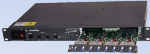
IPC-1840 (coax or phone)